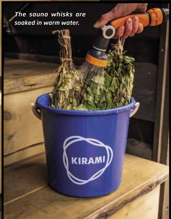
The sauna whisks are soaked in warm water.